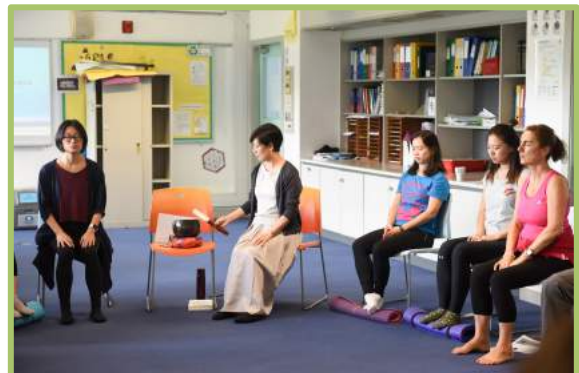
A mindfulness workshop with the teachers of English Schools Foundation